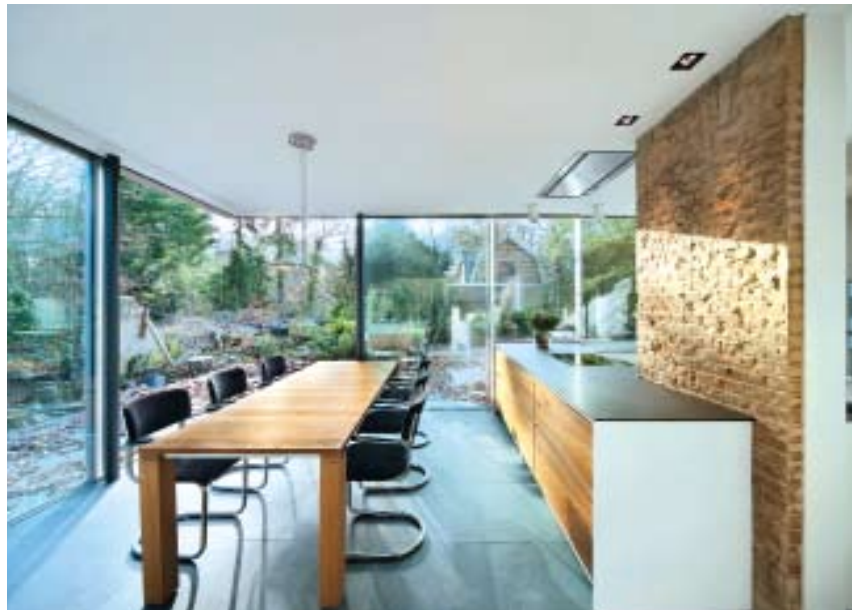
Clear architecture and an unobstructed view of the surrounding greenery are the key features of the dining room. A section of the old brick facade marks the transition between the new and existing building.