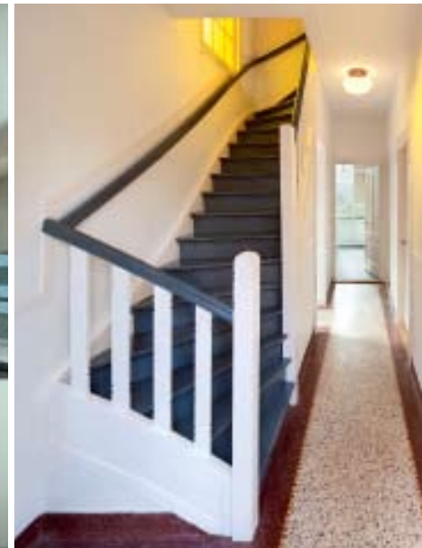
Wooden stairs and terrazzo floors have been preserved in their original condition.

architects opted for internal insulation in the living areas in order to preserve the historical brick facade; this was made from renewable resources for ecological reasons. Flush with the plastered surface, large additional windows protect the original old wooden windows, which now appears as though they are being exhibited in a display case. These also minimise energy loss, which would have been unavoidable in these areas. The old wooden staircase in the hall was in excellent condition. Using internal insulation here would have had a major impact on the structure of the staircase, so the decision was made to insulate this side of the facade externally. The architects had the old bricks removed, ground down and added to the render, which accounts for the characteristic pastel shade of the surface of both the new facade and the annex. New methods of energy generation were also introduced: a geothermal system with heat pump and storage tank now help meet the building's heating needs. Photovoltaic modules on the roof supply the villa with electricity, which, depending on its own requirements, can also be fed into the public grid.