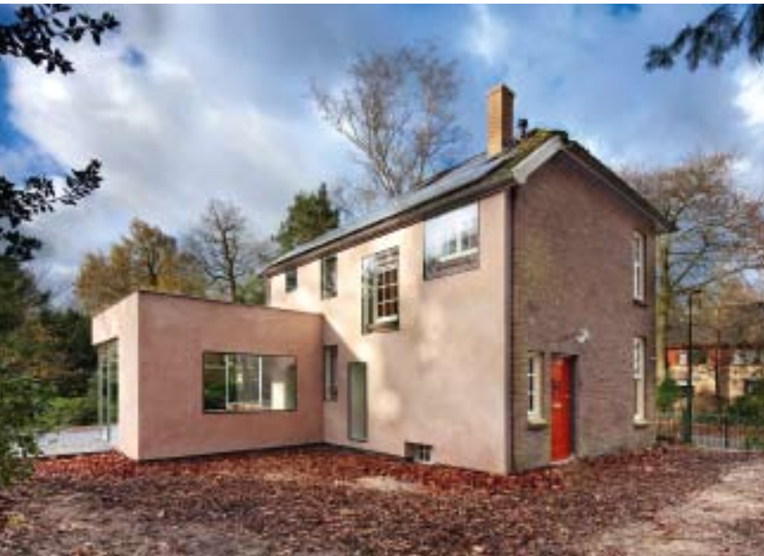
The old windows look like relicts from the past, which, together with the reveals, can be seen behind an additional layer of glass as though they were in a display case.