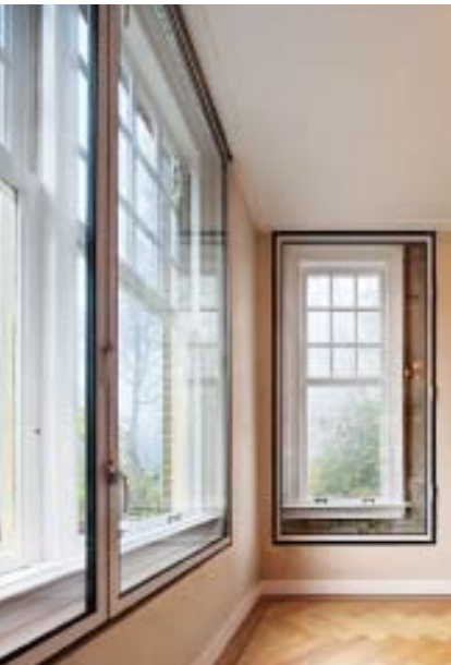
Large glass panels insulate the wooden windows inside.