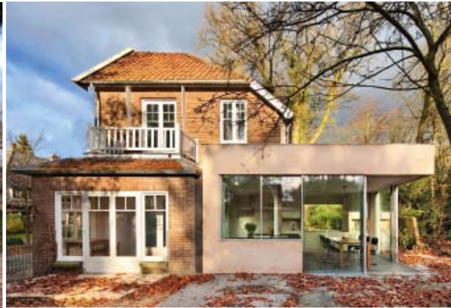
Beside the old conservatory is the new annex with kitchen and dining areas. The smoothly rendered surface here makes a conscious departure from the brick used in the existing building.